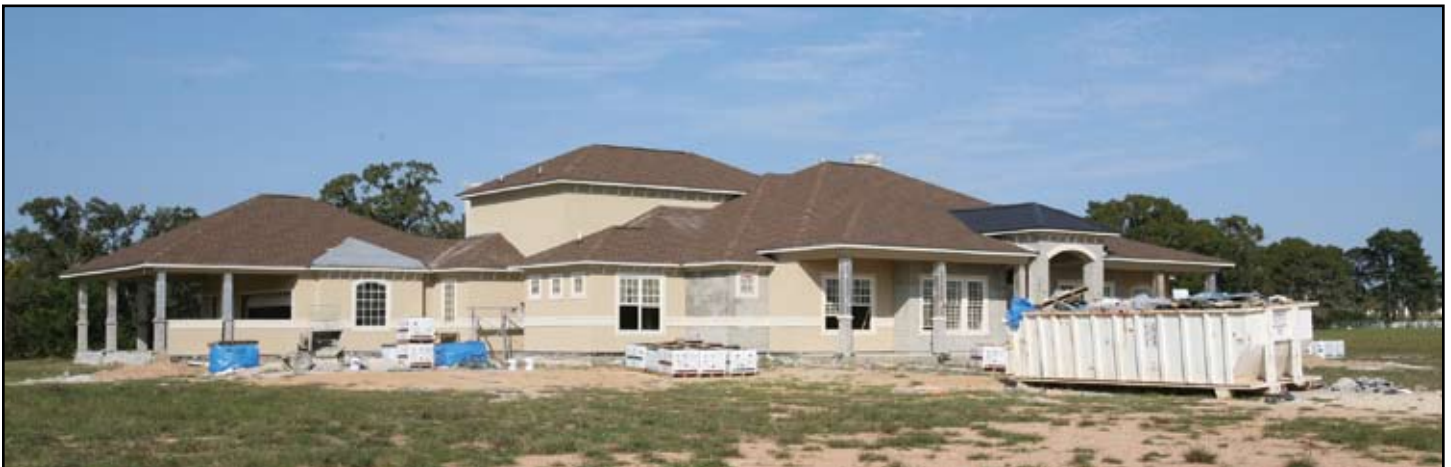
NATIONALLY, HOME SALES came down off the record-breaking mountain of the past three years. In Texas, however, builders continued to build and people continued to buy. Increasing construction costs and land development costs may slow things down in 2007.

Trends in the new home market so far are favorable, but if sales and demand fall even slightly, local builders could face a substantially longer marketing period.