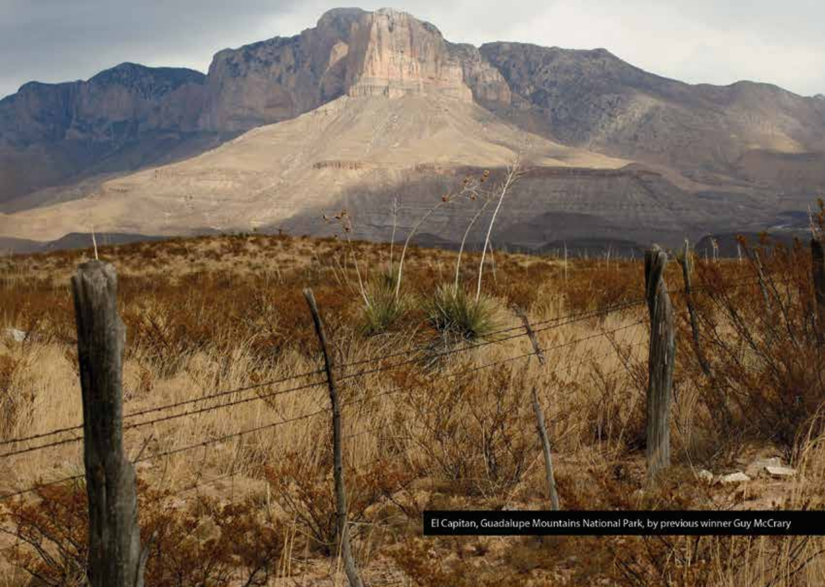
El Capitan, Guadalupe Mountains National Park